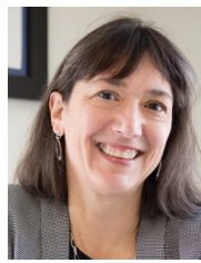
NCI Director Monica Bertagnolli, M.D.