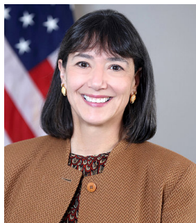
NIH Director Monica Bertagnolli, M.D.

On November 7, 2023, the Senate voted to confirm NCI Director Monica Bertagnolli, M.D., as the 17th Director of NIH. She assumed her duties on November 9, 2023. Dr. Bertagnolli is the first surgeon and second woman ever to lead NIH. A world-renowned surgical oncologist, cancer researcher, educator, and physician-leader, Dr. Bertagnolli previously served as the 16th Director of the National Cancer Institute (NCI), and was the first woman to serve in this position.