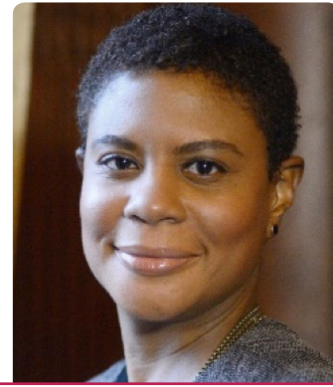
Alondra Nelson, Ph.D.

Alondra Nelson, Ph.D., President of the Social Science Research Council and Professor of Sociology at Columbia University, was the featured lecturer on January 16, 2019, at the Wednesday Afternoon Lecture Series (WALS), the highest-profile lecture program at NIH. She spoke on “The Social Life of DNA” and addressed the intersections of race, science, history, and contemporary social issues. This lecture was co-sponsored by ORWH, the National Institute on Aging (NIA), and the National Human Genome Research Institute (NHGRI). More information on Dr. Nelson is available at https://oir.nih.gov/wals/2018-2019/social-life-dna .