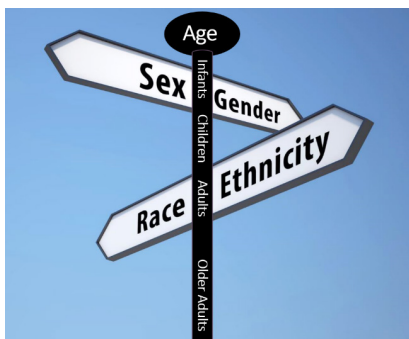
Figure 1. By accounting for the influences of sex, gender, race, and ethnicity across the life course, biomedical research can better inform clinical practice and thereby improve the health of all populations. The graphic illustrates the intersectional relationships between these essential domains (reprinted from ref. 1).

In response to such considerations, NIH Institutes, Centers, and Offices (ICOs), including the Office of Research on Women's Health (ORWH), published a new, comprehensive plan titled Advancing Science for the Health of Women: The Trans-NIH Strategic Plan for Women's Health Research . The strategic plan provides a framework for coordinating NIH efforts to advance science for the health of women by integrating sex and gender influences into the biomedical research enterprise and by ensuring that every woman receives evidence-based disease prevention and treatment tailored to her own needs, circumstances, and goals. The strategic plan also proposes steps to help ensure that women in science careers reach their full potential.