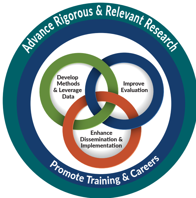
Figure 3. The Trans-NIH Strategic Plan for Women’s Health Research includes five interdependent goals to advance science for the health of women.

The Trans-NIH Strategic Plan for Women’s Health Research includes five inter-related goals essential to support rigorous research and improve the health of women (Figure 3).